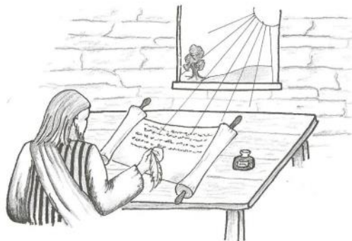
Illustration by Lydia

the will of man: but holy men of God spake as they were moved by the Holy Ghost. ”