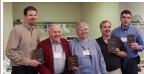
The Gospel of John in German, English and PA Dutch with notes (authors shown)