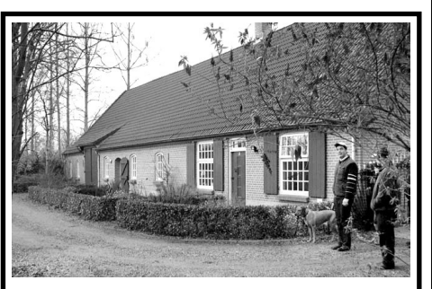
Anabaptist home in Noord Brabant where, nearly five centuries after the burnings at Klundert, new conversions and baptisms have again taken place—this time at the hands of Hutterite believers from America. The cost of following Jesus in the Netherlands has not grown less, and today's believers face spiritual opposition of an intensity never seen before. Pray for them.

the executioner had to push and hold his body into the flames with a fork.