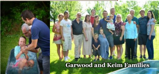
Garwood and Keim Families