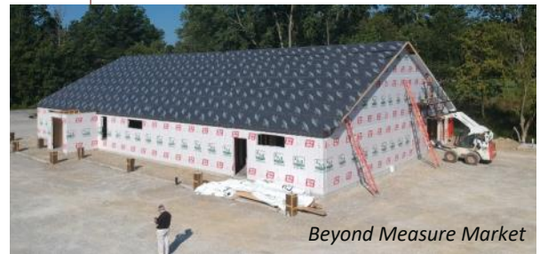
Beyond Measure Market

fulfilled, and my final “You’ve got to be kidding me” said, people’s lives will be changed for eternity because God used Beyond Measure Market , which we believe will truly be “Beyond Measure.”