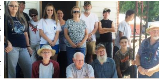
The wonderful volunteers from First Baptist Church of Franklinton, LA

could bring a mission team for two weeks to build something! We had the mission team here the first two weeks in June. They built much of a 2,400 square foot addition