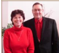
President of MAP