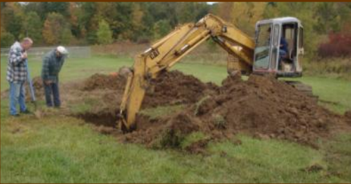
MAP, put up the finances to build a rest room facility.