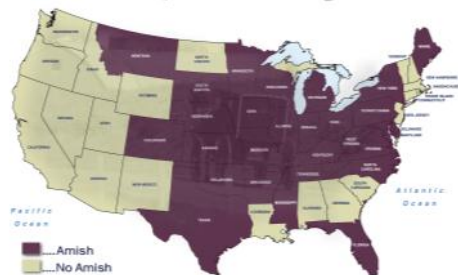
There are 250,000 Amish Living in the U.S.

The spiritual needs are great, but our God is greater. We would ask you to pray for us as we labor with others at MAP to bring the gospel to the Amish.