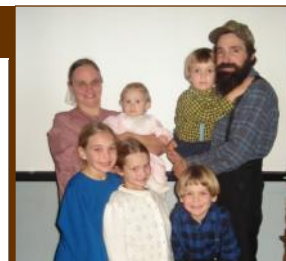
A little taste of what Heaven must be like!

I took a picture of their whole family (right) and brought it back to the office. Several days later we all gathered around the office phone and talked to them.